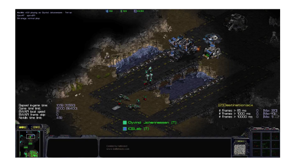
Figure 2: SSCAIT live stream running in HD resolution and controlled by the custom observer script (Mattsson, Vajda, and Čertický 2015).

Figure 1: A web-based interface allowing SSCAIT viewers and bot programmers to vote for the next ladder match.