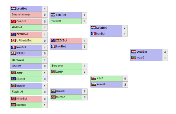
Figure 3: SSCAIT 2016/17 mixed division elimination bracket.